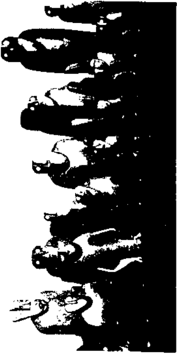
56. Tobi monkey men.