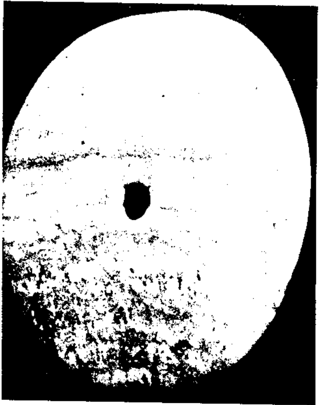
57. Yapese stone money.