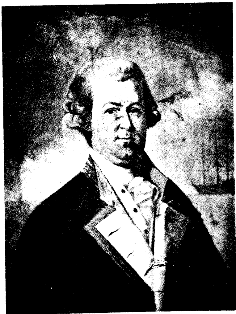
I. Portrait of Philip Carteret